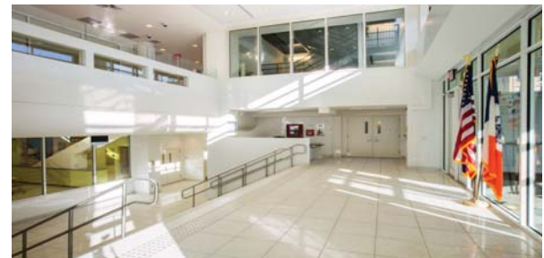
Lobby entrance of PS96 with wide “amphitheatre” stair leading to cafeteria below